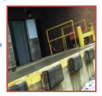
Finished Goods Distribution