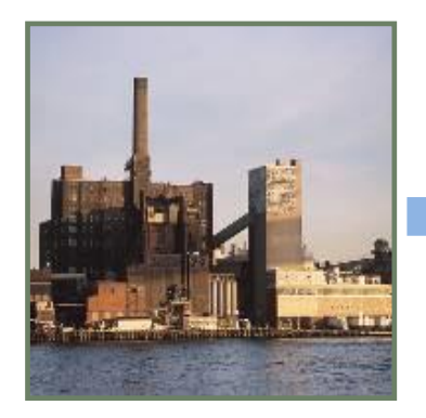
Tier 2 Suppliers