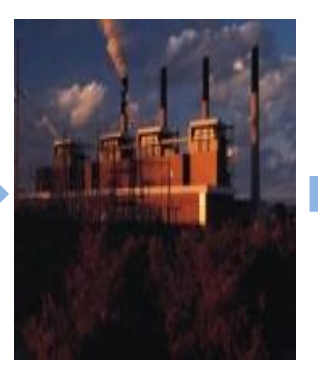
Tier 1 Suppliers