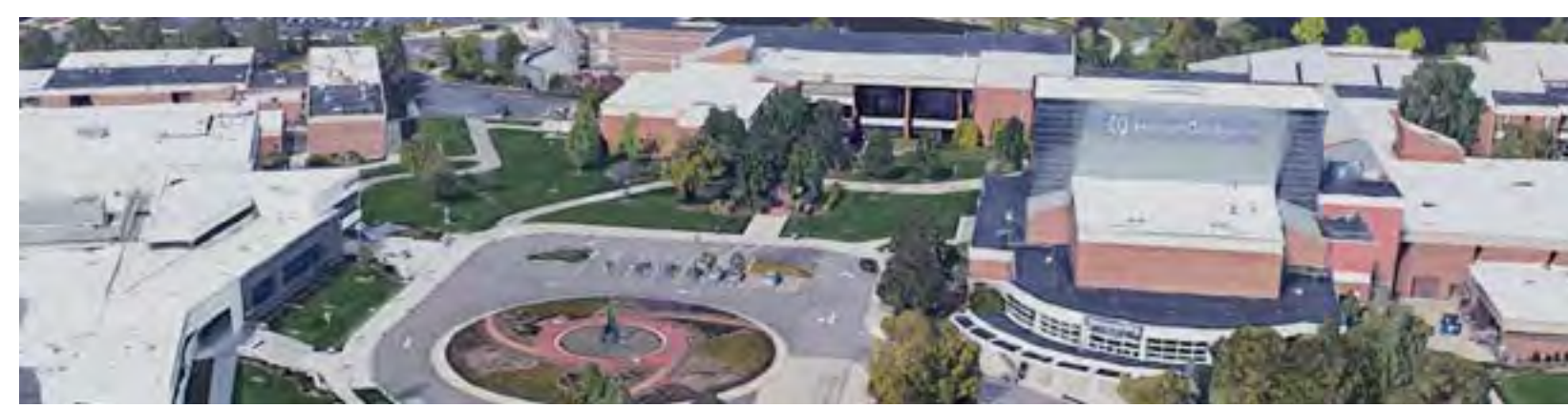
PREVIOUS CONSTRUCTION OUTSIDE BUILDING D

Harper College will undertake a five-year campus master plan update in 2026 to evaluate their progress implementing this Development Plan and make adjustments according to need, funding and/or other influential factors.