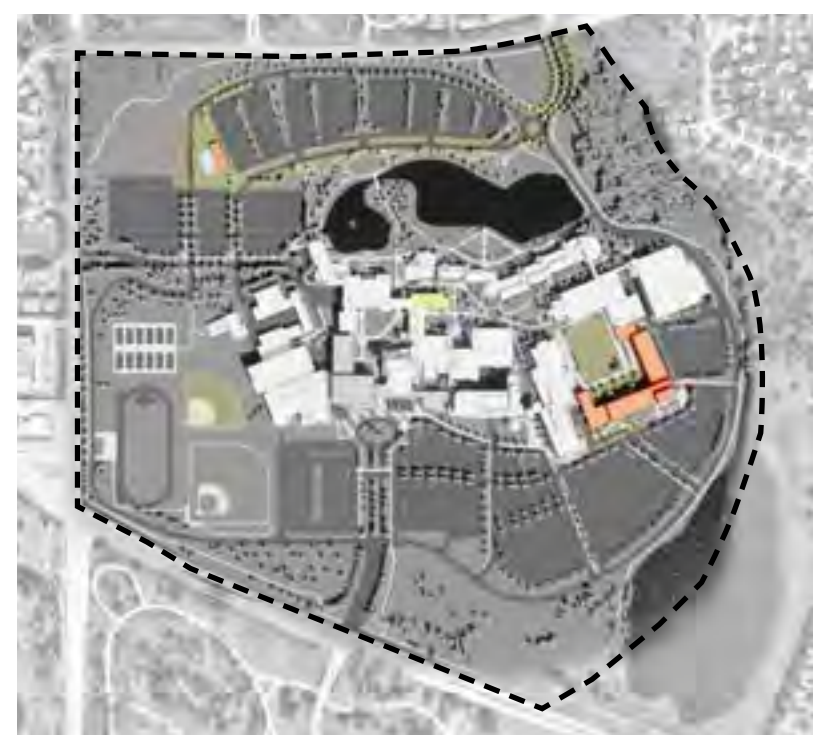
PHASE 2 - ESTIMATED TIMELINE8-9 YEARS FROM PLAN