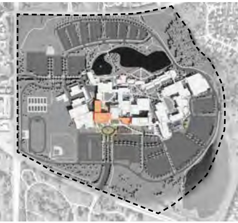
PHASE 1 - ESTIMATED TIMELINE 3-5 YEARS FROM PLAN