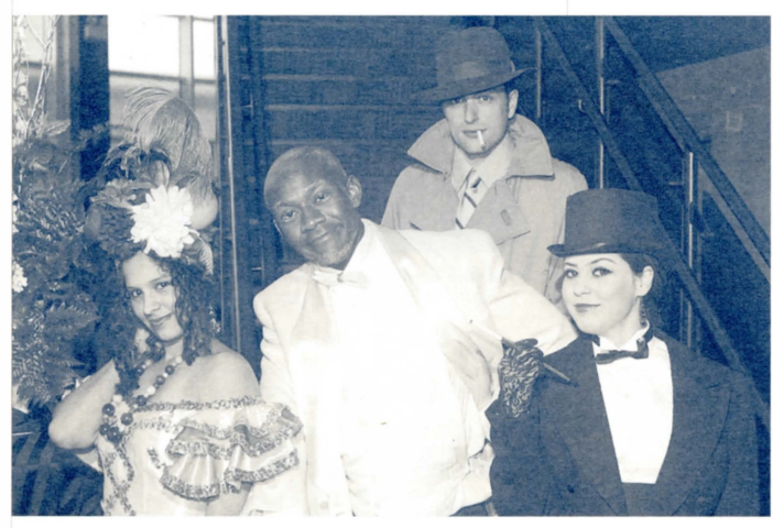
Harper theatre students entertain Gala guests with Hollywood Flair.