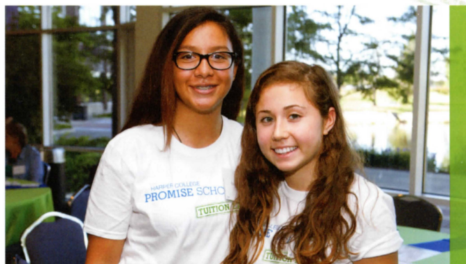
Future Harper College Promise Scholars

High school districts were primarily responsible for communication with students and parents, but Harper did provide outreach support. Methods included email blasts, visits to classes and study halls, letters home and website postings. Harper administrators also