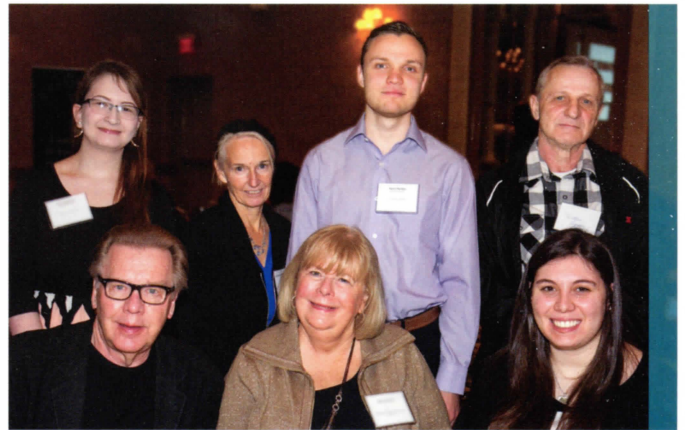
Scholarship recipients met with their scholarship donors at the Harper College Realizing Dreams Breakfast