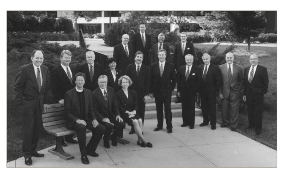
Foundation Board circa mid 1990s