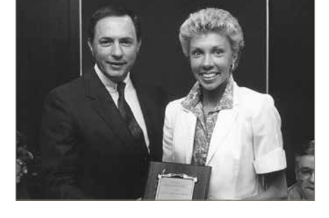
First Amersham Award in 1982