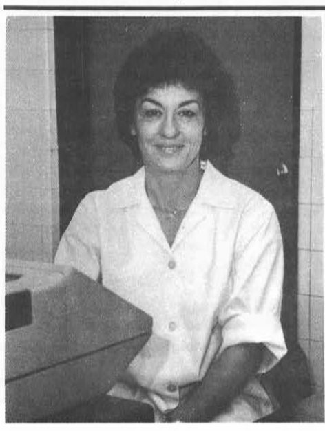
Insider's View of

Congratulations to our three 20-year veterans.