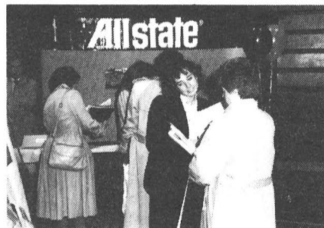
The Employment Fair, held on April 3, provided opportunities for the Harper community to test the job market and meet employers in and around the Harper area.