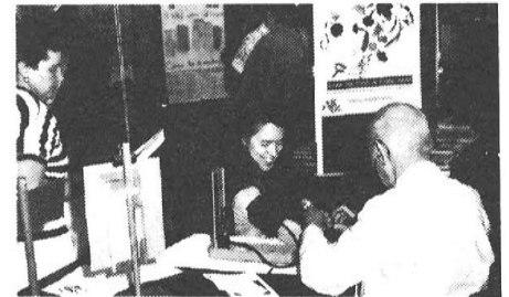
while being screened by area health-service providers.