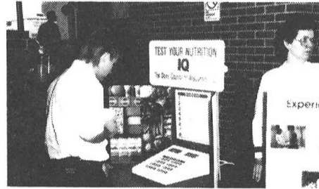
During Harper's Wellness Week in April, participants were able to become more informed about wellness issues...