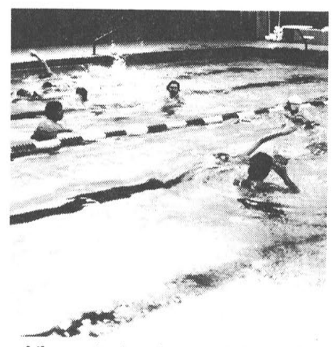
while monitoring the use of the College athletic facilities and equipment.