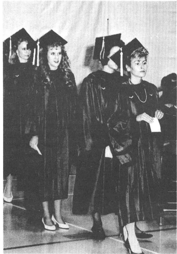
4.0 graduates led the class to the stage to receive their diplomas.