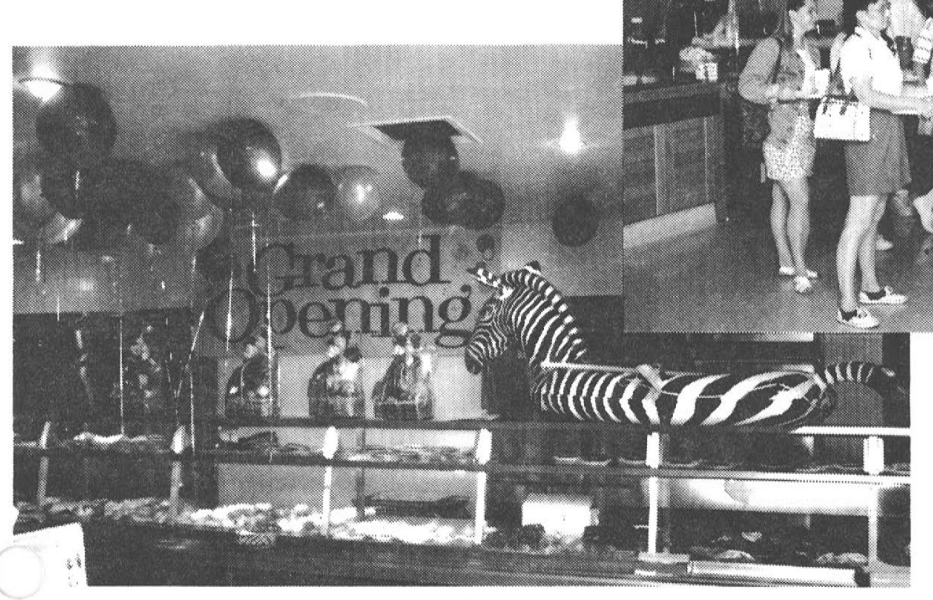
Tri-R, which took over management of the cafeteria on August 1, offered raffle prizes during the celebration. Winners took home fruit baskets, a zebra raft, an antique train set as well as clothing donated by food suppliers. Tri-R plans more celebrations this fall, including Octoberfest and a Halloween extravaganza.

During the first week of classes, students, faculty and staff were welcomed back to the cafeteria with a Grand Opening celebration presented by the new Food Services management company, Tri-R.