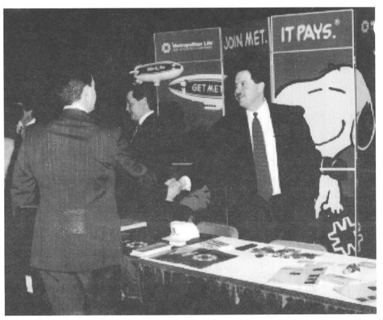
Job seekers met with representatives from area businesses during the Job Fair held on March 23.