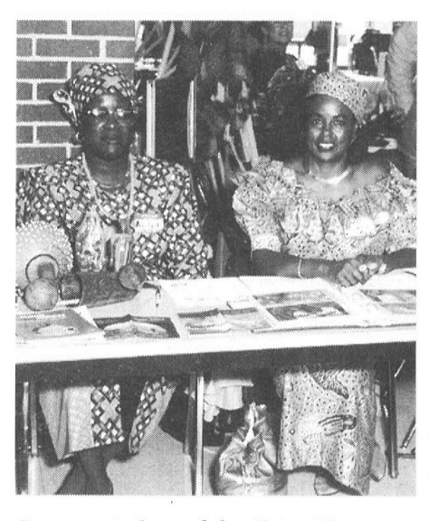
Representatives of the Sister City program shared information on life in Cape Coast, Ghana, at the Festival of Nations during Harper's Intercultural Week: Unity Through Diversity.