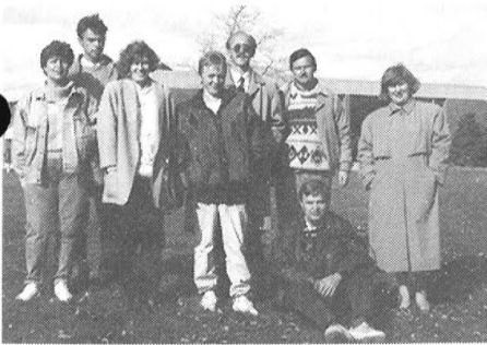
Thirteen managers and administrators from a production plant in Volgodonsk, Russia, have been on campus this month for extensive training in the English language and American culture. Members of the group, above, who are participating in the Special American Business Internship Program, have been living in area homes. From here, they travel to industrial assignments throughout the Midwest.