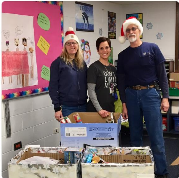
7:51 AM - 14 Dec 2018

We are so grateful for the generosity of Ss and staff at Harper College for their donation of toys for our families in need this holiday season. Community partnerships like the one between @ccsd59 and @HarperCollege are powerful!