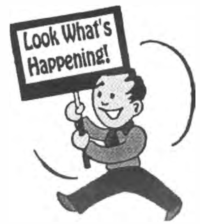
Assembled by Patrick Chartrand

May 25 Adopt-a-Highway #2 10 a.m., parking lot 1