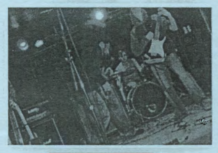
Go Hang in action

away the distortion and throat wrenching cries, the music of both bands is left sounding like a wellthought-out, musically sound piece," stated Hubert. "The difference is buried deep within that purity; the actual chord progressions, leads, melodies, vocal harmonies, and patterns."