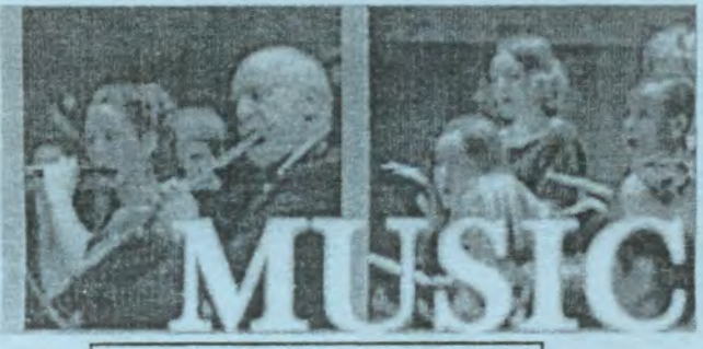
Harper music students

The introduction and literature classes are offered to students to familiarize them with the basic concepts of playing music and the literature behind the music that is played. The classes are Introduction to Music, Music Appreciation, Introduction to Music Literature, Instrumental Literature, and Keyboard and Vocal Literature. Each of these classes is offered to all students interested in them, although, mostly majors and minors will be in them.